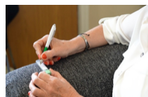
Check Date on tube