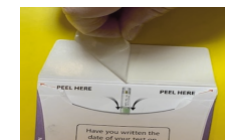
Stick down seal