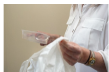
Container or Bag?