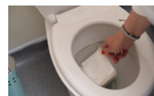
Container into Toilet