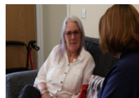
Ask for help