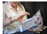
Open your test kit