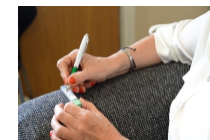
Write on bottle