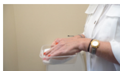
Tissue in Container